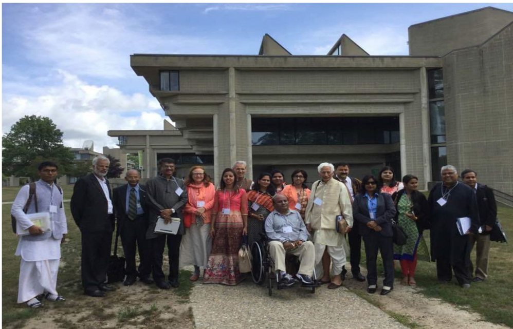
Group of Delegates attended 23 rd International Vedanta Congress